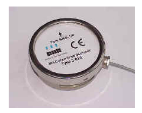
Figure 2 - MAC View®-Particles Sensor 2.02d

Our production process of the MAC View ®-Particles Sensor 2.02d includes calibration of every unit.